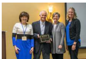
Patient-Centered Innovation Award Roaring Fork Family Practice