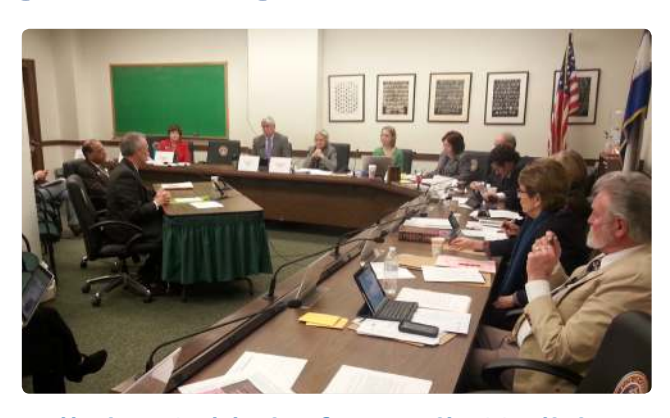
Full Time Lobbyist for Family Medicine

The CPCC is dedicated to advancing primary care via the Patient Centered Medical Home (PCMH) by focusing on delivery reform, payment reform, patient engagement, workforce training, and benefit redesign. Securing over 180 supporting organizations in 2014, the CPCC continues to push its vision of patient-centered comprehensive and coordinated primary care services sustained through practice transformation and payment reform resulting in improved health for individuals and communities.